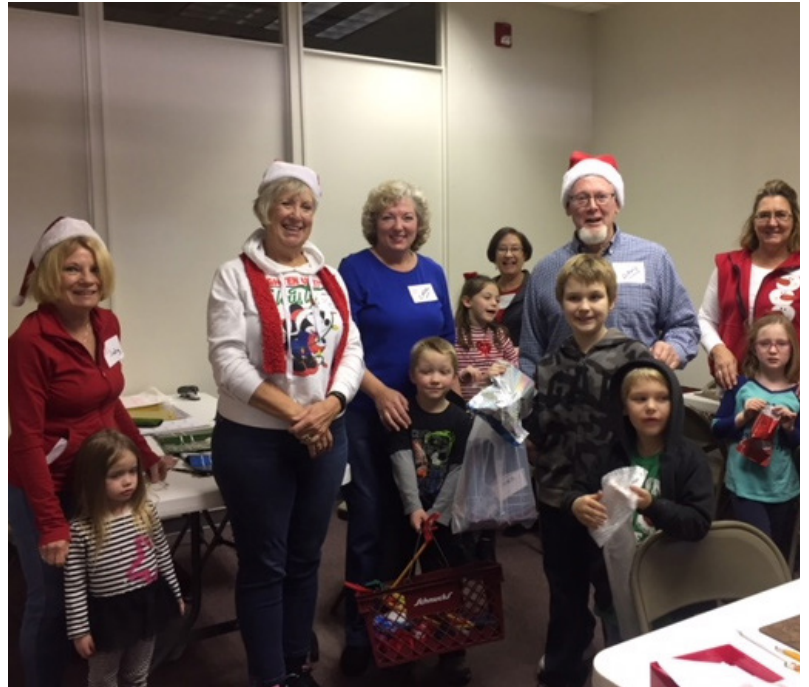
This is a photo from the Mini O'Beirne Crisis Nursery Holiday Shop. I volunteered with the Springfield Ski Club, and also took my grandsons shopping.